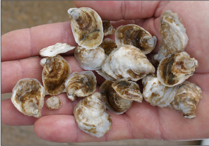
Figure 2. Oyster seed ready to be planted.

is difficult to measure phytoplankton at a growing site, though using a Secchi disc to measure clarity/turbidity can give a rough estimate of the food available. One good indicator of food availability is the presence of other filter-feeding organisms, such as naturally occurring oysters, clams, or mussels. Again, areas with good water flow will usually have adequate food to support your oyster garden.