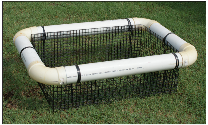
Figure 3. Taylor float designed to hold oysters in the upper water column.

Taylor floats, named after their inventor, were the first containment devices introduced to oyster gardeners (Fig. 3). Taylor floats attach a wire mesh basket to a floating PVC frame. The basket is usually constructed of plastic-coated wire mesh with 1-inch-square openings. The PVC