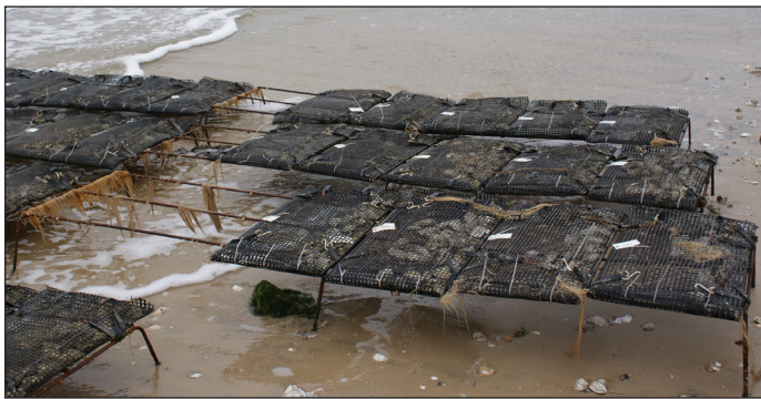
Figure 5. Rack-and-bag culture system for growing oysters in the intertidal zone.

Bottom cages also keep oysters several inches above the bottom and are another popular containment system for gardeners and commercial oyster growers. Bottom cages can be made any size, but larger cages will require heavy lifting devices. This particular gear is best for very firm sediment or rocky bottoms. Bottom cages operate much like Taylor floats; they require plastic mesh bags until the oysters are large enough to remain within the cages.