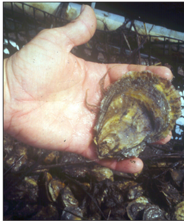
Figure 1. The Eastern oyster, Crassostrea virginica .

Non-commercial oyster aquaculture, popularly known as “oyster gardening,” has received a great deal of attention throughout the range of the Eastern oyster, Crassostrea virginica (Fig. 1). Some people might oyster garden to help restore oyster stocks or improve water quality. (Oysters improve water quality by filtering out algae and sediments, and an adult oyster can pass up to 50 gallons of water per day through its gills.) Other people choose oyster gardening as a way to grow a tasty meal. Regardless of your reasons, oyster gardening can benefit our coastal environment.