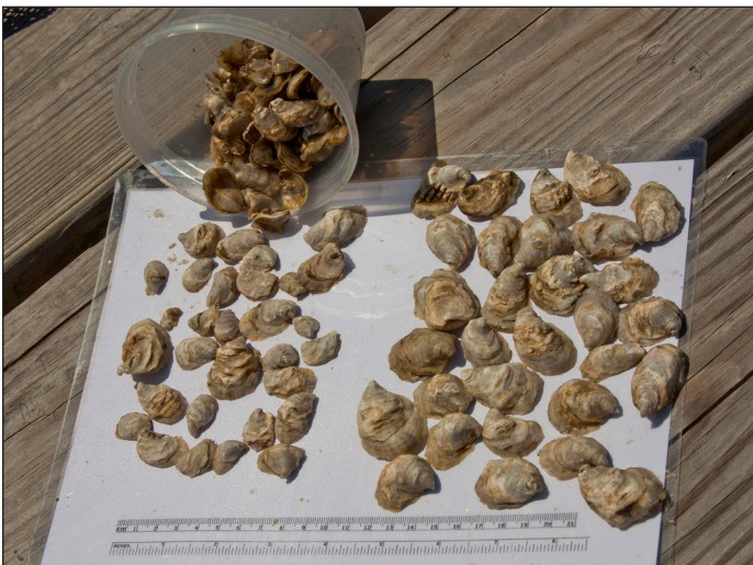
Figure 6. Randomly sampled oysters (left) contain a wide range of sizes, but selectively sampled oysters (right) are more uniform in size.