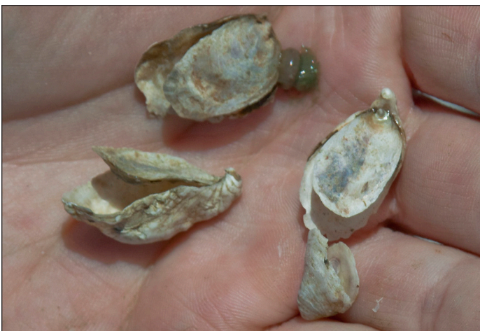
Figure 7. In this picture, dead oysters are open without any soft tissues inside. Sometimes dead oysters will be found with decaying tissue still inside.

contribute to their oysters' growth rate—such as water temperature or food availability. Using a Secchi disc to measure turbidity could provide a crude estimate of food availability.